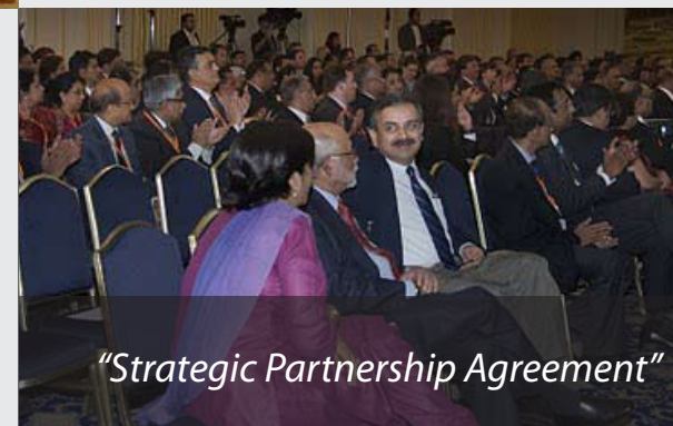
"Strategic Partnership Agreement"

For the investors, India is now a land of a billion opportunities. In the corridors of international power the rise of India is seen as an inexorable process. This view is founded on India's nuclear capacity, democratic resilience and economic dynamism. India is becoming one of the faster growing free market economies of the world with a sustainable development model built on a solid foundation of entrepreneurial energy, youthful dynamism and creativity. Brand India is now firmly entrenched in the international psyche. It is seen as a growth engine of the global economy. Therefore the transformation of India into one of the world's leading economies with scientific and technological competence and a stable democracy is a truly phenomenal achievement.